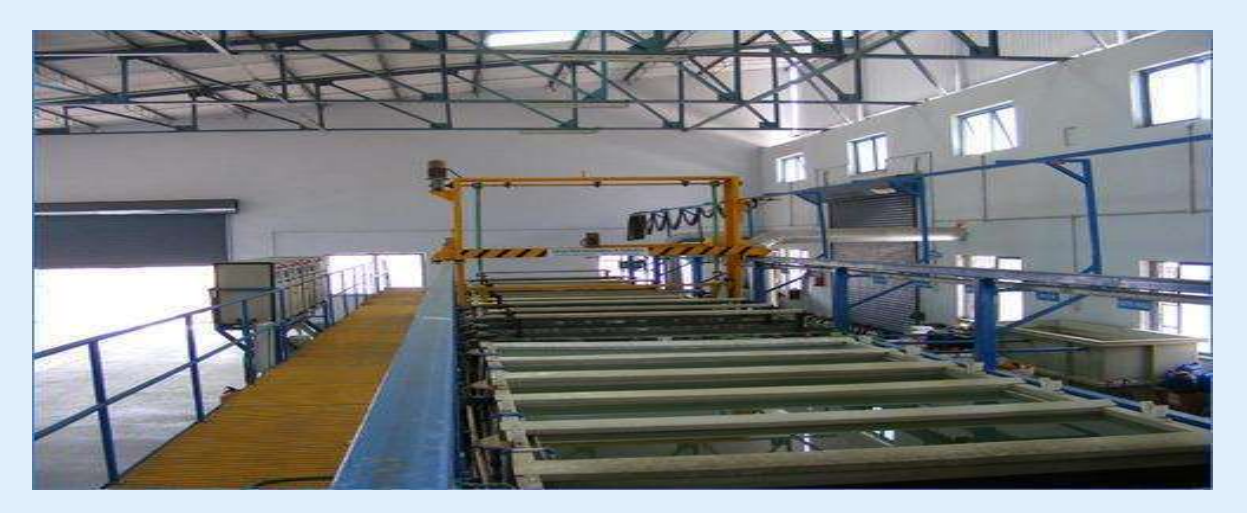
**We have experienced project management team for supporting EPC contractor for defense sect