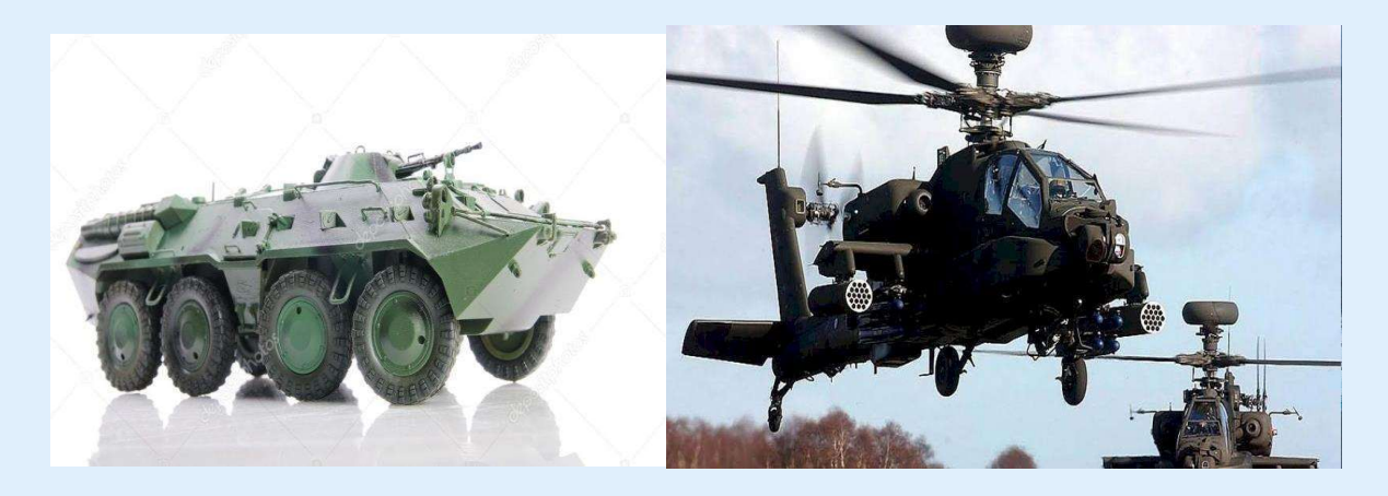
Project supplying and Automation engineering for defense: