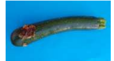
NEW PHOTO