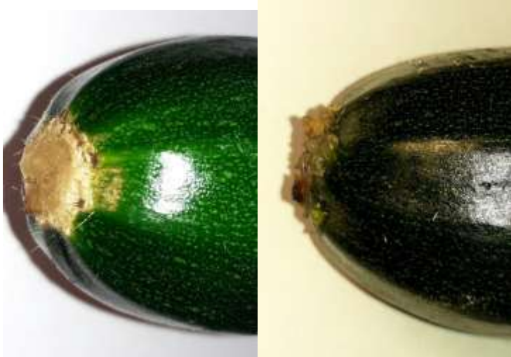
NEW PHOTO - provided by Italy

“Jelly exudates are not considered foreign matter in courgettes. However, these exudates can also detract from commercial presentation and acceptance of courgettes. Thus, courgettes must be practically free of visible dried exudates . Wet jelly exudates are not acceptable . Deposits or drops of dried jelly exudates in courgettes are only acceptable as exceptional . Its presence would be according the quality tolerances of the standard. In this sense, a 1% by number or weight of courgettes with presence of dried exudates will be accepted for Class I and the 10% in the case of Class II.”