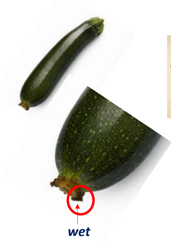
Illustration #. Floral remains – Not allowed

“Floral remains adhered to the skin will be allowed provided they are dry, clean and have not been detached from the pistil area . The pistil area must be dry and dry floral remains must be easy to remove .”